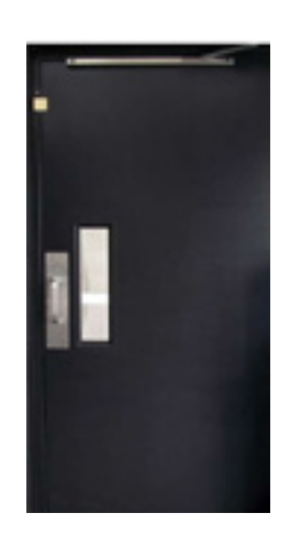
Fire Rated Door